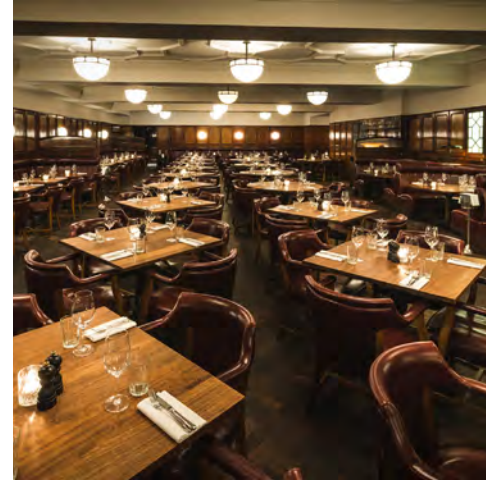
Guildhall EC2V 5BQ