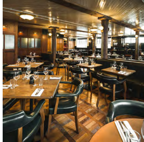
Borough SE1 9AQ