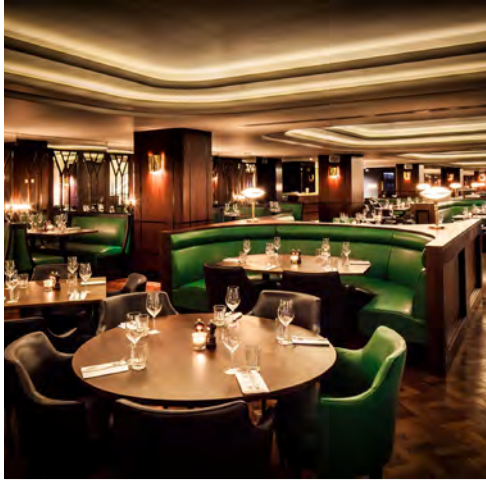
Air Street W1J 0AD