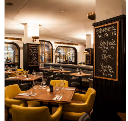
Knightsbridge SW3 2AL