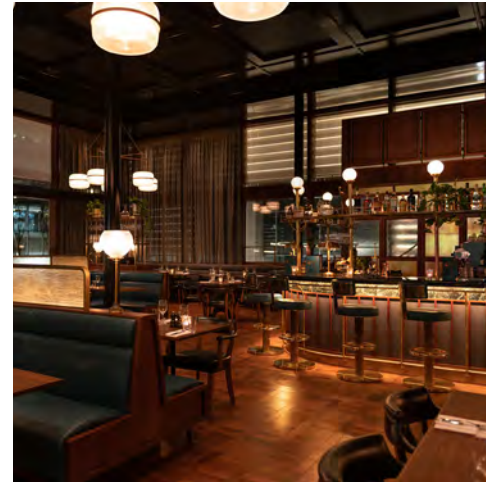
Wood Wharf E14 5GX

All our restaurants are available for full hire. To enquire, please email events@thehawksmoor.com