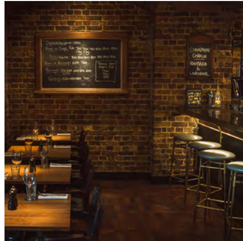
Spitalfields E1 6BJ